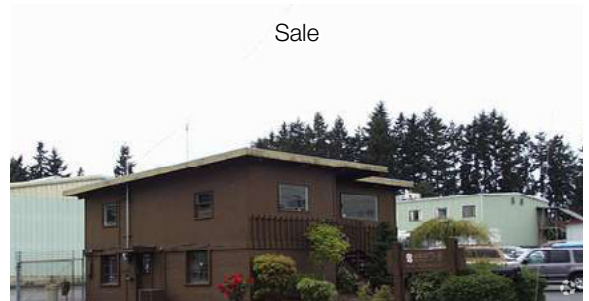
Ballinger Property 20041 Ballinger Way NE, Seattle • Total SF: 39,500 SF (Land) • Seller: Investor