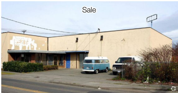
Harper Building 312 S Lucile, Seattle • Total SF: 4,000 SF Industrial • Seller: Investor