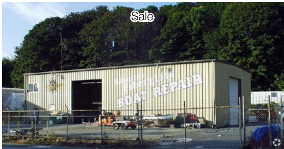
Gem Welding 3031-3051 W Comm. Way, Seattle • Total SF: 5,304 SF & 3,200 SF Industrial • Seller: Investor