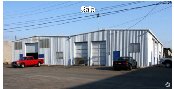
Specialty Bottle Building 5251 - 5th Ave S, Seattle • Total SF: 8,800 SF Industrial • Buyer: Investor