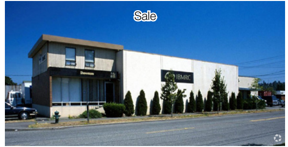
Decor West 300 S Lucile, Seattle • Total SF: 7,440 SF Industrial • Seller: Investor/User