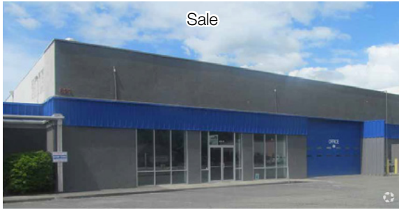
Summit Window 821 Central Ave S, Kent • Total SF: 26,060 SF Industrial Office • Seller: User